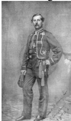
General Thomas Francis Meagher

Meagher, escaped from Van Diemen's Land in early 1852 and made his way to the U.S. When the Civil war exploded he organized a company C of Irish Zouaves for the Union cause and was given the rank of Captain. He was wounded on two occasions. He retired as General Meagher and died mysteriously in Montana in 1867, possibly at the hands of vigilantes, officially drowning in the Missouri River after falling over-board from a river boat.