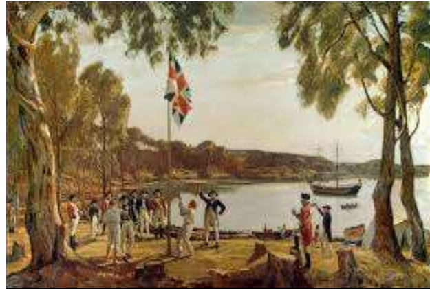
Governor Phillip raising the Union Flag at Sydney Cove, January 26 th 1788

world'- Port Jackson, as described by Phillip. Soon the fleet was on the move again and on the 26 th January 1788, Phillip, the principal officers and other marines gathered around an erected flagpole and history was enacted. A toast to the new settlement was given and the Union Flag was raised. A volley was fired by the marines as a salute.