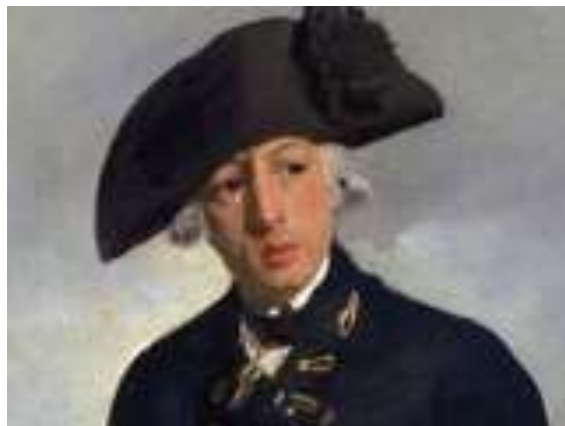
Governor Arthur Phillip