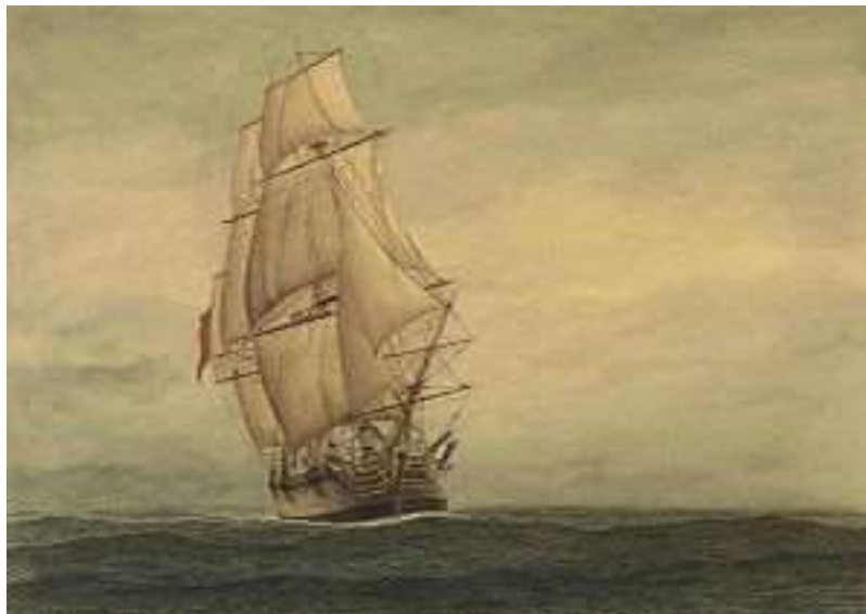
Lady Penryhn – First Fleet