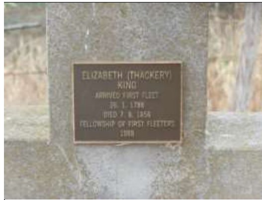
Plaque that has been added to Betty's memorial. Erected in 1988 by the Fellowship of First Fleeters.

Her memorial is located in the Back River chapel cemetery which is on the Lawitta Road, just off the Lyell Highway not far out of New Norfolk. A number of other first fleeters are buried there as well, many now having no tombstones marking their last resting place.