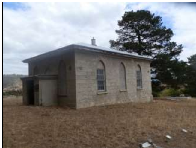
Back River Chapel 2020

Betty, outlived Samuel and having no children, left the property to Ebenezer Shoobridge(2). Samuel is buried somewhere in the Back River chapel cemetery. He died 21 st October 1849 aged 86.