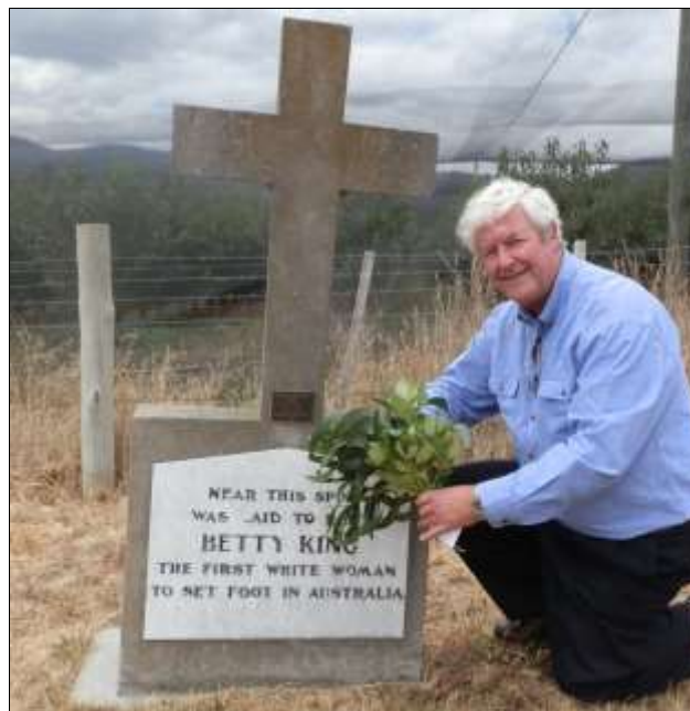
The author laying a posy on Betty's Memorial, Australia Day

In 1856 the Hobart Town Courier newspaper reported: "THE FIRST WHITE WOMAN IN NEW SOUTH WALES – Mrs Elizabeth King the first white woman that landed in New South Wales, died this week at the Back River, New Norfolk". (August 7)