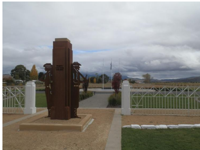
New Anzac Park Brighton at the site of the once Brighton Army Camp.

An era has now passed. The historical significance of the site cannot be underestimated. Not so long ago after its closure it was suggested it would be a good site for a fun park. That obviously did not eventuate.