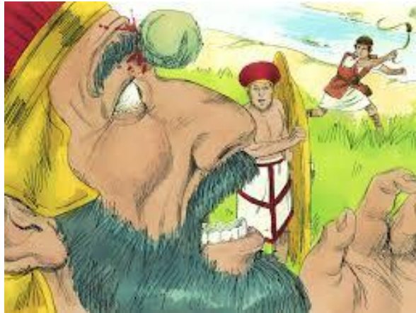
Elijah killing Rurik

So Elijah prevailed over Rurik with a sling and a stone and struck him dead. There was no sword in the hand of Elijah. Then Elijah ran and stood over Rurik and took Rurik's own sword and finished him off. When the Vikings saw that their champion was dead, they fled. The men of England rose with a shout and chased the Vikings as far as the seas where the Vikings fled in their boats, back to their lands in the north, never to return.