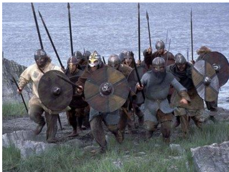
Fierce Vikings raiding England.

Sadly what Lord Francis had feared came to pass. Knowing of the death of Alfred, the division of the English and the weakness of the land, the Viking hordes landed from their magnificent sea galleries and plundered the country. The people mourned and bemoaned that there was no Alfred to save them from the terror and hardship which now prevailed. Good folk were raided by the Vikings who butchered the men of the villages and took the women and children back to the cold lands of the north to be slaves. Would there be no one to save England from this nightmare? No Alfred the Great? No King Arthur of old?