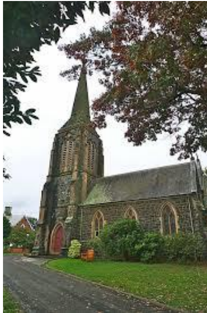
St Mary's Hagley Notice the spire.