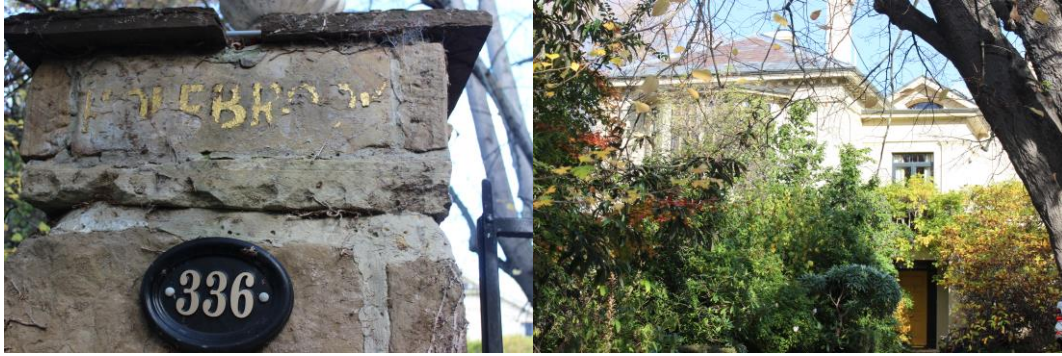
Holebrook, 2020.