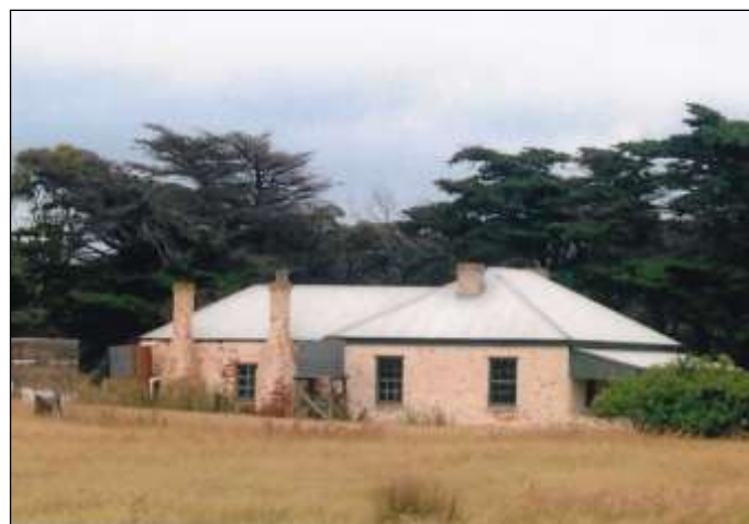
Buildings at Wybalenna 2020.