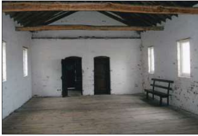
Interior of Wybelenna Chapel 2020.