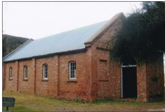
Chapel, Wybalenna 2020.

suggesting, 'Blackman and house'. Under Robinson's guidance proper accommodation for the aborigines was erected and the village that had arisen at Wybalenna put into order. Gardens were planned. Robinson himself used his own talents as a builder and bricklayer. The centre of life was the chapel. The following year, Governor Arthur left the shores of Tasmania to become Governor-General of Canada. Sir John Franklin was his replacement. Matters regarding the welfare of the natives passed between and through the various government departments, but sadly, the numbers of the natives continued to decrease. Another blow was to happen in 1839, when Robinson left Wybalenna. He finally conceded defeat. After he left, the remaining natives suffered neglect. They became sad and remorseful. By 1842 of the 200 aborigines taken to the settlement more than 150 had perished. When Sir and Mrs Jane Franklin and Bishop Nixon visited the area they found but 54 aborigines left.